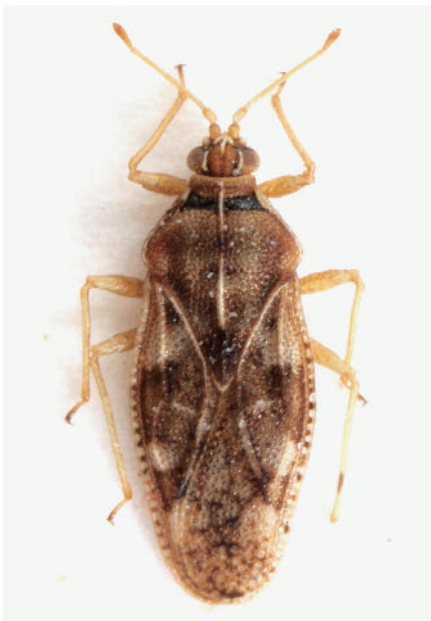
Fig. 1: Monosteira unicostata (Mulsant & Rey), a male from Koper, photo A. Gogala.

The brown marmorated stink bug is native to East Asia (Japan, Korea and eastern China) (Rider 2006). After the introduction to North America (USA) in 1996, it was detected in Europe first in 2004 in Switzerland and Liechtenstein. It spread fast and was detected in Germany and Greece in 2011 (Milonas & Partsinevelos 2014), in France and Italy in 2012, in Serbia in 2015 (Šeat 2015), in Spain in 2016 (Dioli et al. 2016). It is also known from Austria, Hungary, Romania and Russia. Halyomorpha halys is extremely polyphagous and a pest attacking numerous agricultural and ornamental plants (Milonas & Partsinevelos 2014, Maistrello et al. 2017). When searching for wintering shelters, it enters houses. As it had been already widely distributed in northern Italy, it was expected to reach Slovenia as well. Nova Gorica, situated at the border, is a place where several invasive species had already been detected. Halyomorpha halys was found there by the Institute of agriculture and forestry Nova Gorica (Kmetijsko gozdarski zavod Nova Gorica) (Rot et al. 2018). We publish here some additional records from the same city. Janez Kamin collected also nymphs of all five stages in front of his home and reared two of them into adulthood.