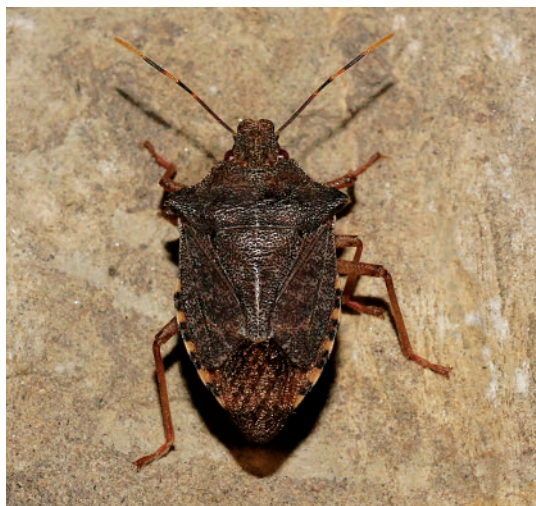
Fig. 4: Picromerus conformis (Herich-Schaeffer), a male from Nova Gorica.