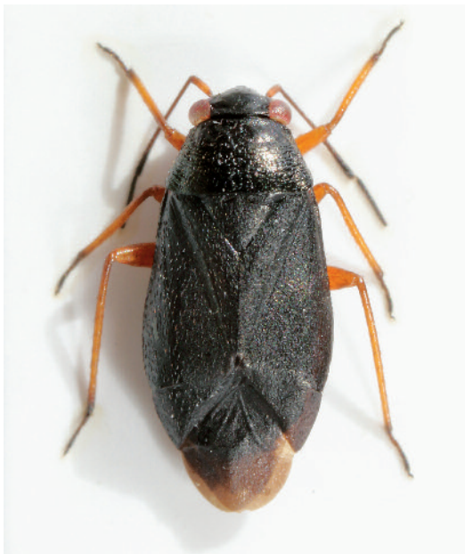
Fig. 2: Heterocordylus erythropt-halmus (Hahn), a female from Brezje, photo A. Gogala.