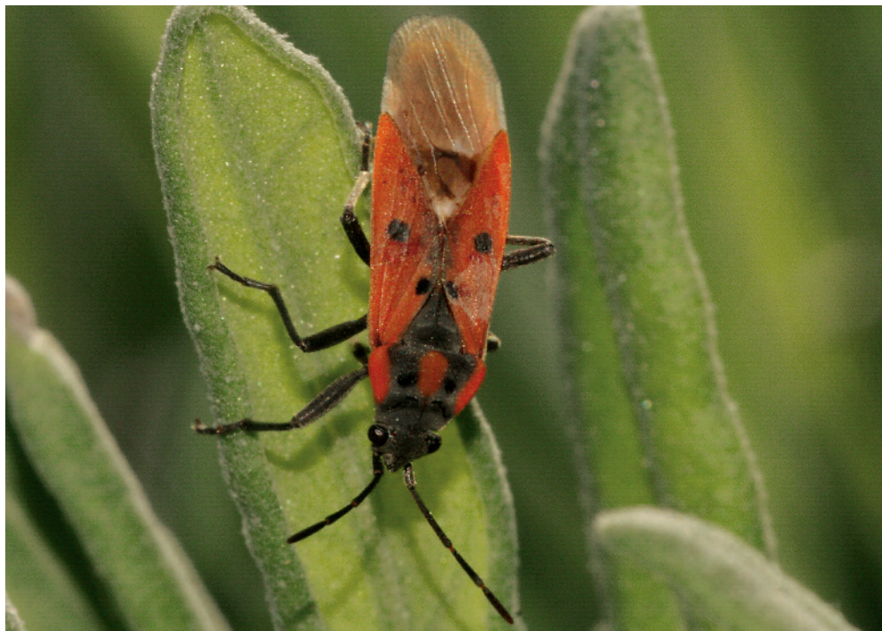
Fig. 3: Lygaeus creticus Lucas on Lavandula in Koper, photo Duša Vadnjaj.